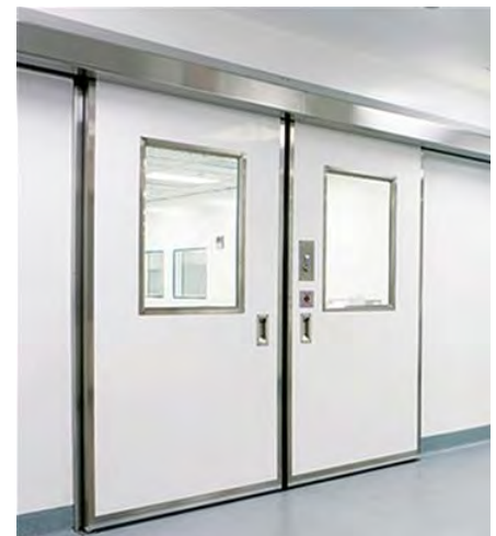
Bi-Parting Molded Fiberglass Door