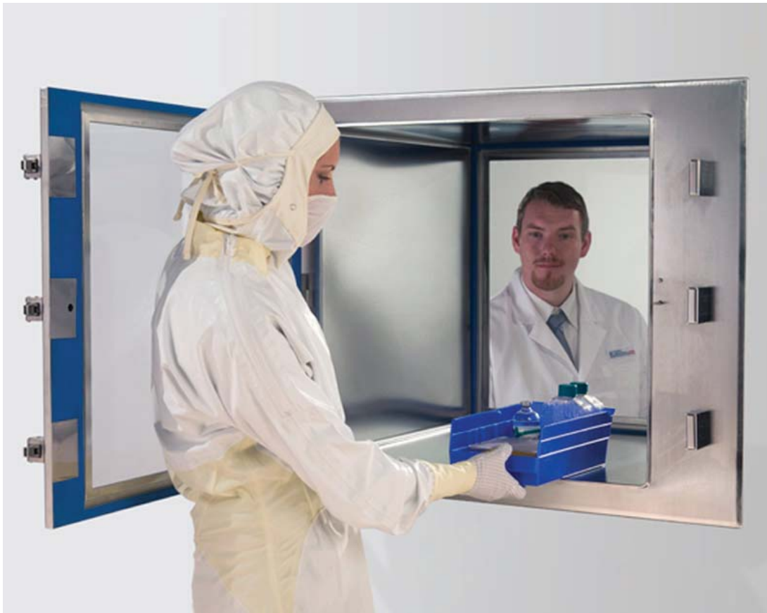
Type 316 Stainless Steel Pass Thru with Isolated Interlock.

Once in the gowning room, watches, jewelry and any clothing not to be worn in the cleanroom should be stored on the "dirty" side. The personnel in special garments then progress to the "clean" side of the room. The sticky mat should be at the entrance of the cleanroom with a waste receptacle placed near it. Due to the "dirty" to "clean" transition, the garment room is a good path to bring items into the cleanroom, either using a pass thru, or by carrying them in.