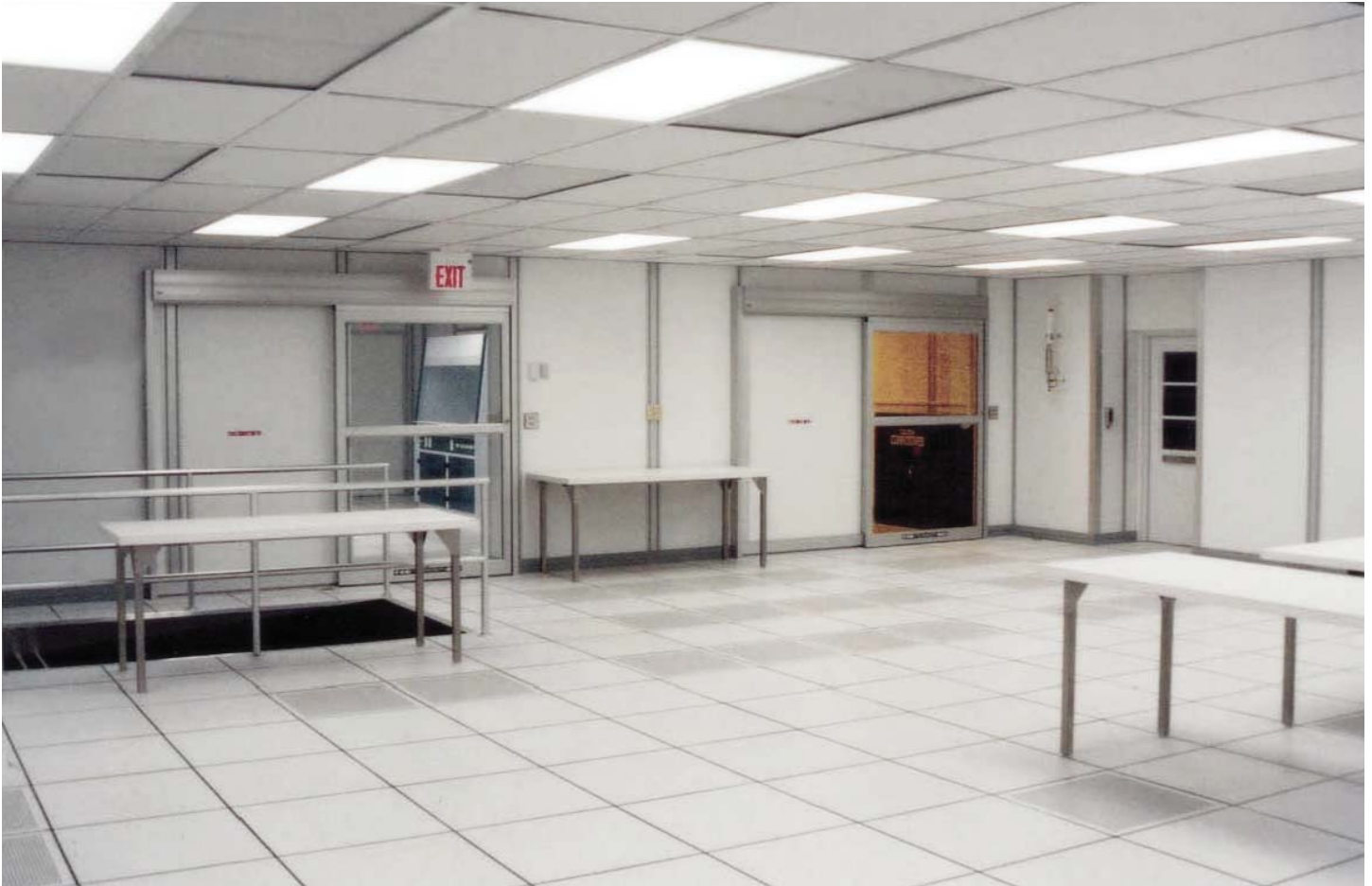
Class 100 (ISO 5) Cleanroom with Raised Floor (at rest).