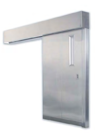
Single Sliding UL Rated Fire Door

With over 40 years of combined experience, our professional sales consulting team will ensure your mission-critical requirements, while maintaining our uncompromising dedication to quality and value added service.