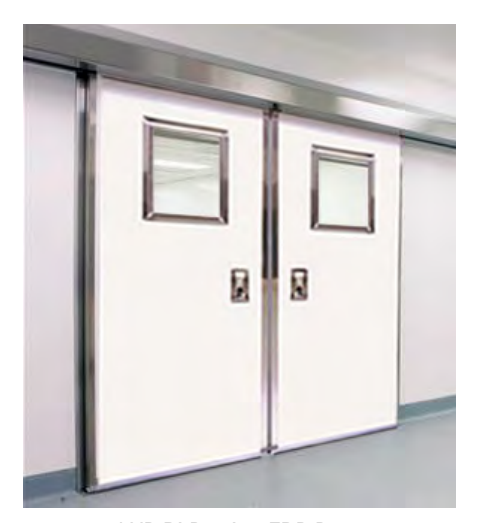
LXP Bi-Parting FRP Door

Totally seamless (no center seams), high strength, fiberglass panel. Stainless steel edge cap and side frames add strength and protection making it ideal for personnel and product transfer. The consistency of performance in the LXP matches the high quality of the Excel door systems. The gearless AC Asynchronous motor and on-board self-adjusting microprocessor control system is a perfect example of the quality built into the LXP.