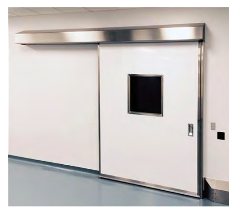
LXP Single Sliding FRP Door

Superior aesthetics, uncompromising quality, exceptional reliability and unmatched value define the LXP doors. Designed from the ground up to far exceed the offerings of other door manufacturers, yet priced to meet demanding budget constraints, the LXP is truly the "no compromise" clean door solution.