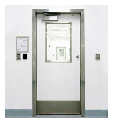
Single Swinging Fiberglass Door

With over 40 years of combined experience, our professional sales consulting team will ensure your mission-critical requirements, while maintaining our uncompromising dedication to quality and value added service.