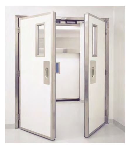
Paired Swinging Fiberglass Door