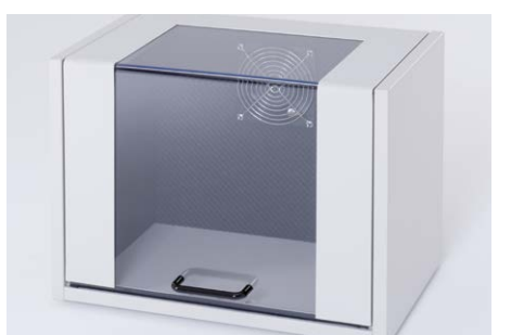
Noise protection box