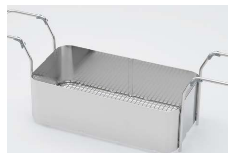
Baskets made of stainless steel