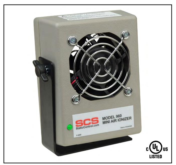
Figure 1. SCS 960 Mini Air Ionizer