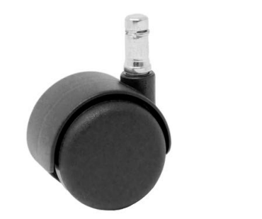
02 - Black Hood *02B - Black Hood w/Brake

2" HARD DUAL WHEEL- For Standard Tile & Carpet - *Braking casters not recommended for carpet (Not for concrete)