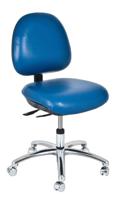
PN: ACE845BT-RQ-V901-A28P-07 POL (Model pictured may not be standard model.)

Seat: Vacuum formed, sealed air exchange seat & bladder (18 1/2"W x 17"D) (R) Back: Vacuum formed, sealed air exchange back & bladder (18"W x 16"H) (Q) Upholstery: ESD vinyl upholstery BT control w/cover: 2 levers - Seat height, back angle. Back height adjusted w/knob Cylinder: Chrome plated w/sealed ends and filters Footring: 20" diameter, adjustable, chrome (for bench heights only) Base: 28" diameter aluminum base Casters: 2" conductive chrome hooded, steel caster ESD Package Cleanroom Class 10 Package Weight capacity: 300 lbs