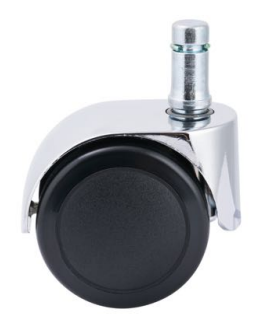
09 - Chrome Hood 09B - Chrome Hood w/Brake 09RB - Chrome Hood w/Reverse Brake

2" HARD DUAL WHEEL- For Standard Tile & Carpet - *Braking casters not recommended for carpet (Not for concrete)