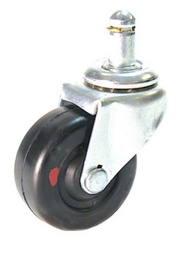
03 2" Rubber, Non-Conductive Single Wheel

09RB, 10RB Reverse brakes engage when chair is occupied.