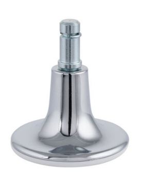
G4 Chrome Plated Steel Glide w/Nylon Bottom