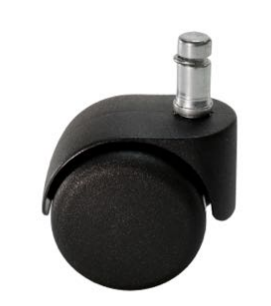
*B01B - Black Hood w/Brake