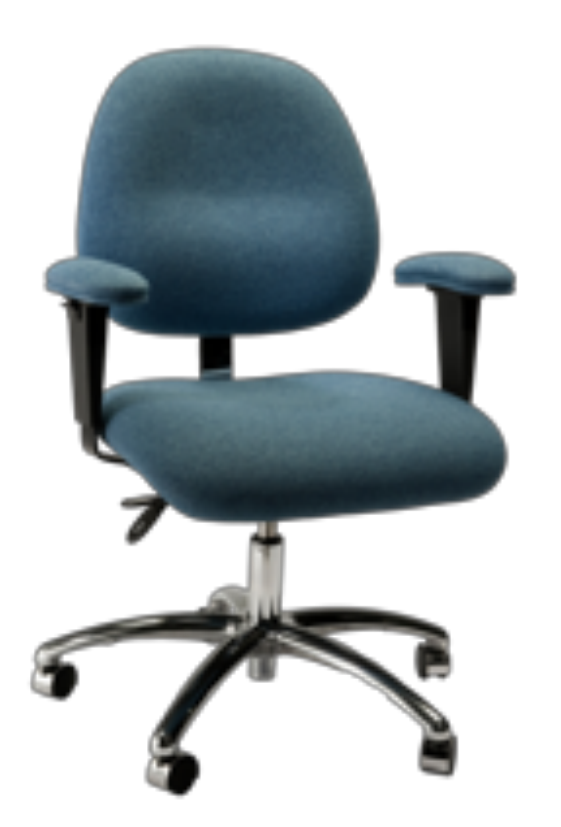
PN: 445IT-GE-F124-A28P-01-TF POL (Model pictured may not be standard model.)