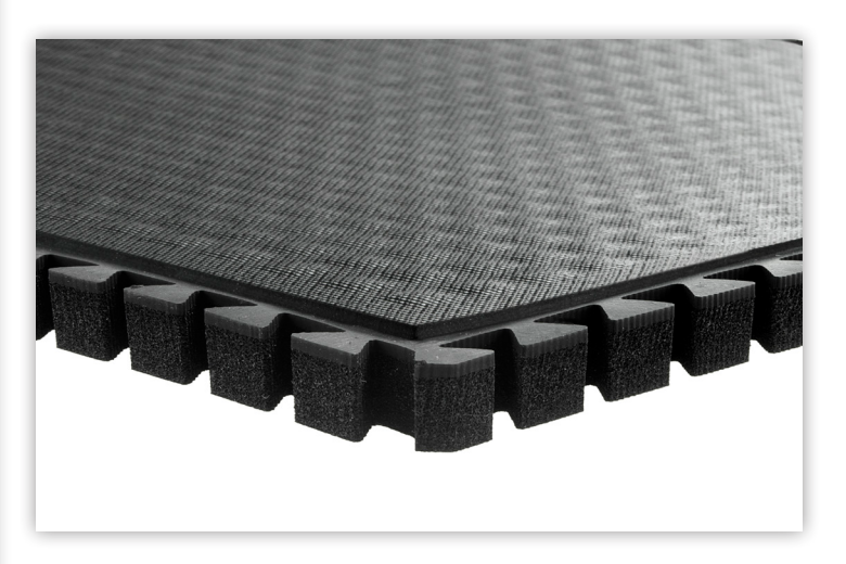
Hog Heaven III Traffic

Note : Mat sizes are approximate as rubber shrinks and expands in conjunction with temperature and time. Tolerable manufacturing size variance is 3-5%.