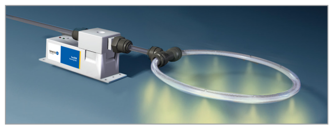
Air Ring Output Application

Simco-lon has developed a DC in-line ionizer that has the ability to provide fast decay times through output tubes up to six feet in length. Since the ion-to-ion recombination down the output tube is so limited, the single output tube has the ability to be split into multiple tubes each with excellent performance allowing the fusION ionization source to service multiple locations from a single ionization source. This unit comes equipped for use with clean dry air (CDA); however, a Nitrogen (N2) kit is available.