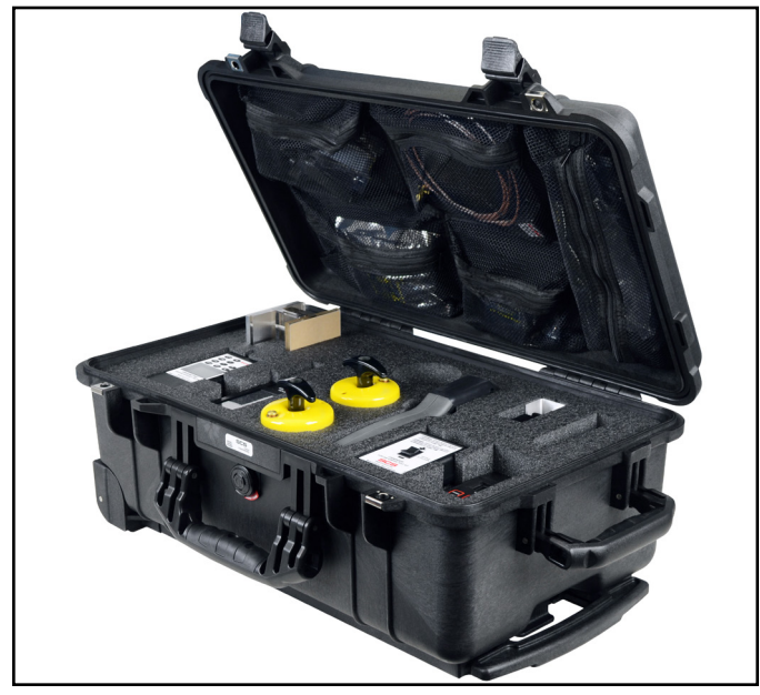
Figure 1. SCS 770045 EOS/ESD Assessment Kit