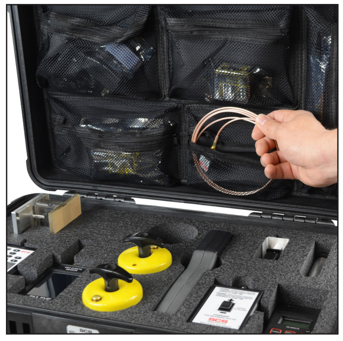
Figure 2. Using the EOS/ESD Assessment Kit's lid organizer

https://www.esda.org/standards/esda-documents/