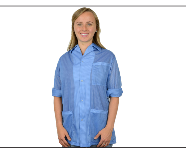
Figure 1. Desco Statshield<sup>®</sup> Smocks with Convertible Sleeves and Snaps Cuffs.