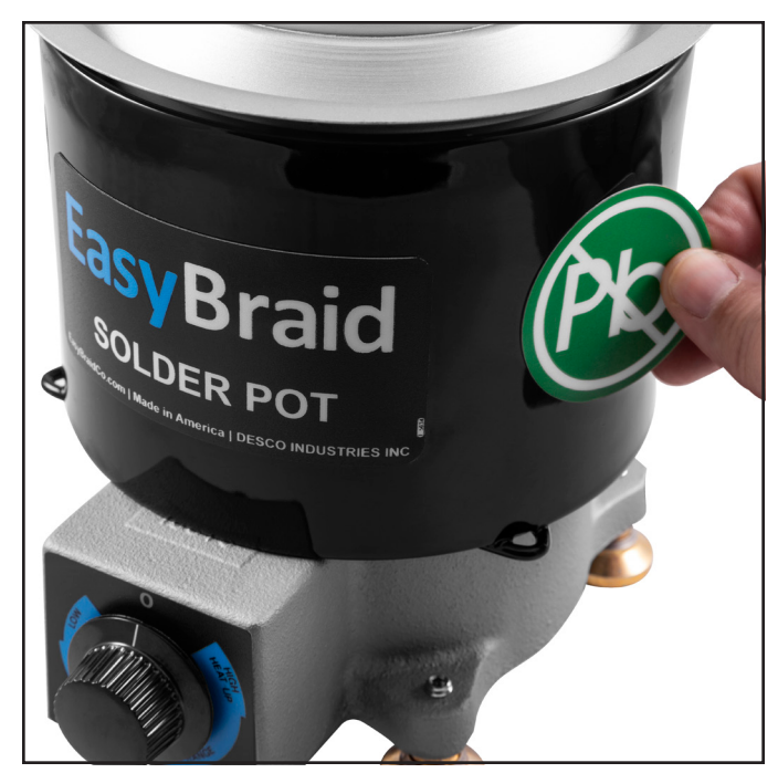
Figure 3. Applying the lead-free label onto the Solder Pot