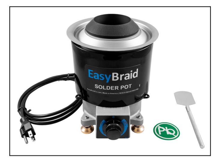
Figure 2. EasyBraid Solder Pot packaging contents