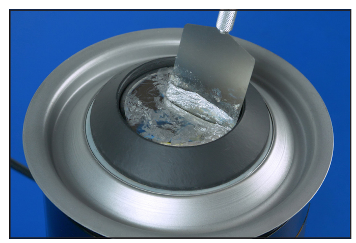
Figure 5. Using the solder dross removal tool

Use the included solder dross removal tool to clean the molten solder as needed. Butt the tool's curved spatula to the inside edge of the crucible to collect the solder dross. The liquid solder will drain through the tool's serrated edge. All dross can be placed onto the dross tray and later discarded.