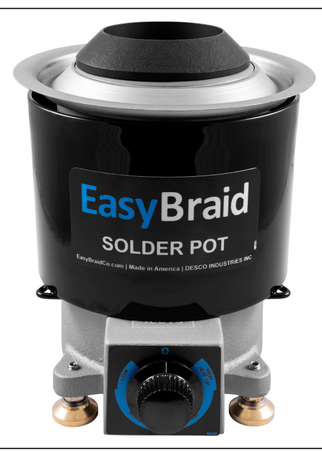
Figure 1. EasyBraid 670030 Solder Pot