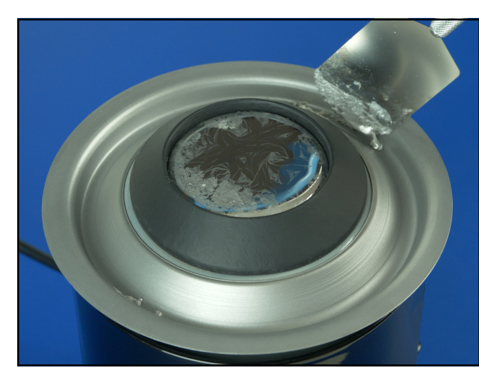
Figure 6. Placing solder dross onto the solder dross tray

CAUTION: The dross tray gets hot when the Solder Pot is powered. Turn off the Solder Pot and allow the dross tray to cool before handling.