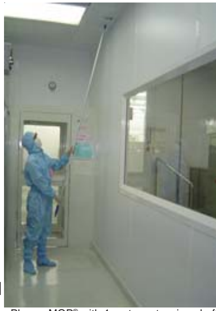
PharmaMOP® with 1 meter extension shaft weighs only 800 grams

PharmaMOP® is designed for all critical cleanroom surfaces allowing the operator to clean ceilings, walls and floors with ease. The system combines a patent-pending mop head optimized to meet label indicated disinfectant contact times and an ultra-lightweight, telescoping handle and frame affording unsurpassed cleaning efficiency. The system, with a saturated