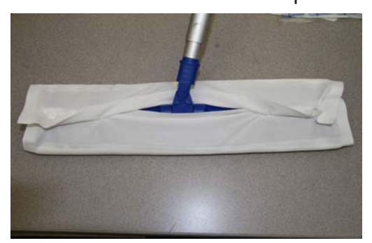
PharmaMOP® with Mop Head

A third set of snaps has been added to facilitate a better fit on either mop frame.