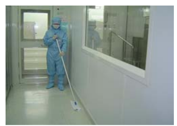
FT416C (handle shown) with FS853 (mop head) is compatible with professional and pulling mopping motions.