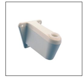
Wall Bracket U90578