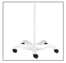
Premium Floorstand U53060