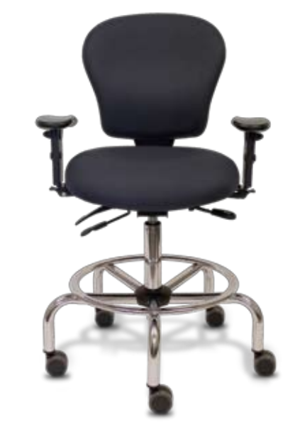
CLS53 (shown w/KR240M arms) Great for petite to medium builds and based on the design of the PA53