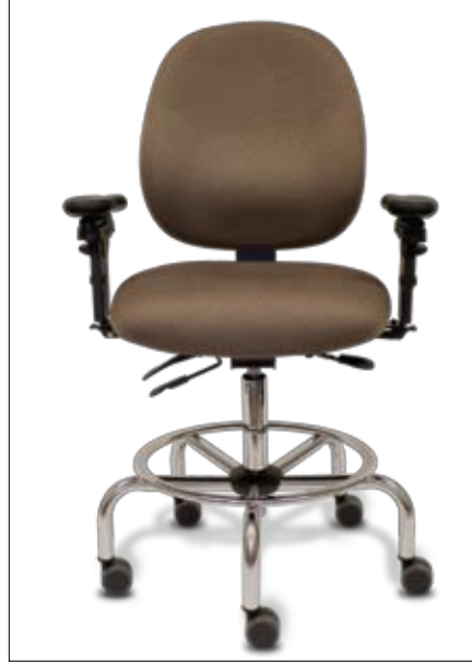
CLS57 (shown w/KR251 arms) Extra generous seat and back design inspired by the PA57

Gain peace of mind from userfriendly control mechanisms and OM's standard 12-year limited warranty. We stand behind our chairs, so that you can be even more comfortable sitting in them.