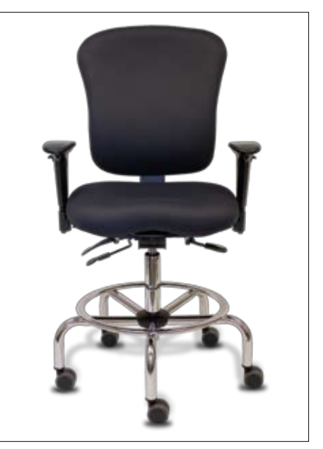
CLS61 (shown w/JR37 arms) Attractive and versatile stool with the amazing contours and "sit" of the PA55