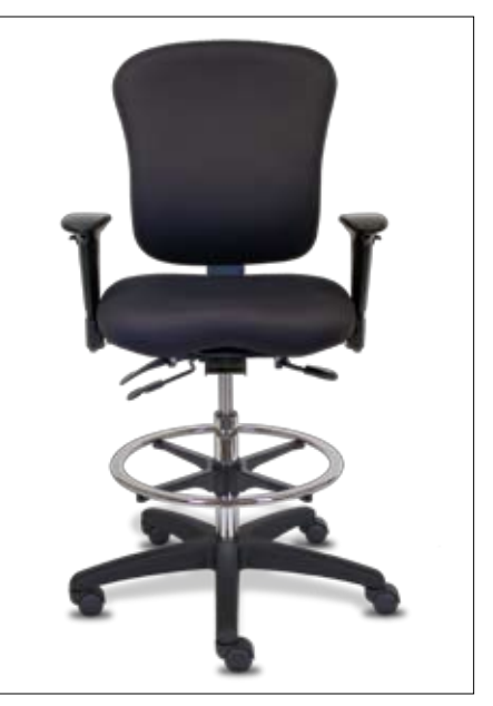
CLS61 (shown w/JR37 arms and optional Turn-lock footring package) Adjustable footring available for upcharge.

Ease-of-use comes from the standard Grande Spider Package (GSP) that takes the guesswork out of footring adjustment and gives CLS chairs superior mobility.