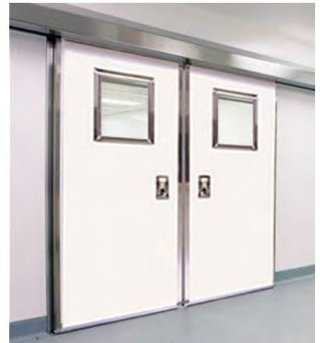
LXP Bi-Parting FRP Door