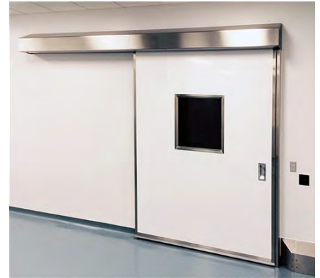
LXP Single Sliding FRP Door

With over 40 years of combined experience, our professional sales consulting team will ensure your mission-critical requirements, while maintaining our uncompromising dedication to quality and value added service.